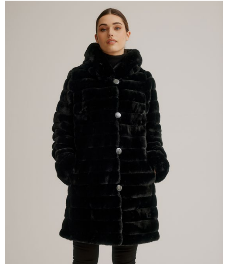
K4129R-164 COLOR: 009 BLACK (REVERSE SIDE)