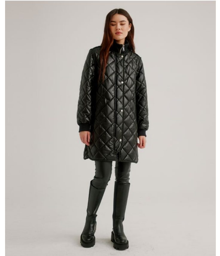
K5594R-815 COLOR: 009 BLACK