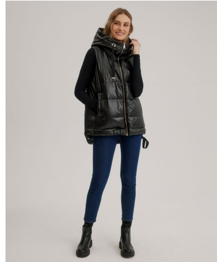
K5340R-213 COLOR: 009 CREAM