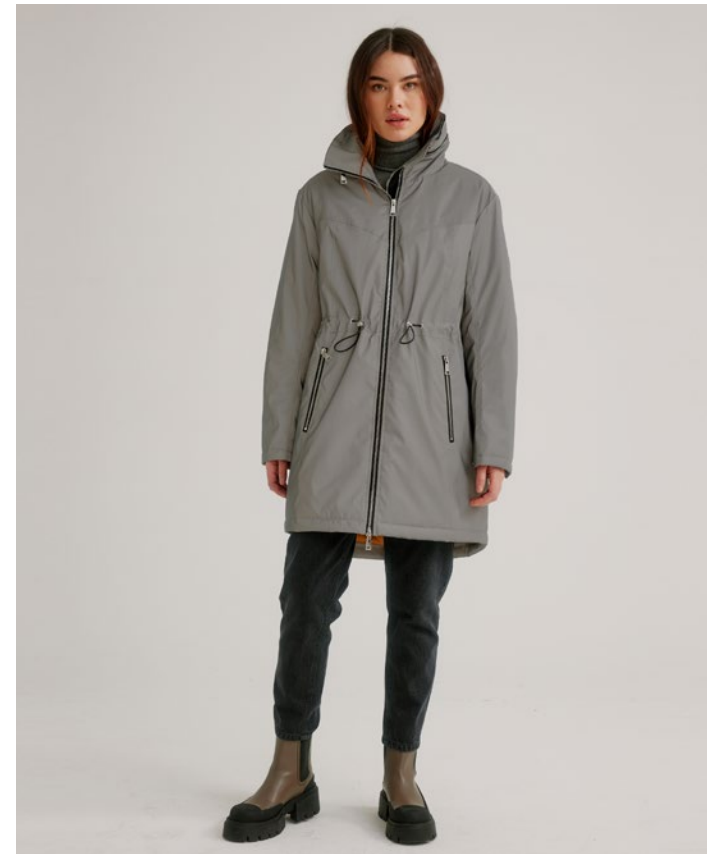
K5580R-290 COLOR: 002 SILVER