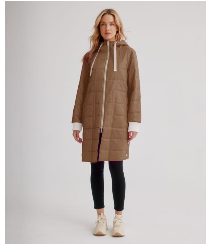
K5457R-373 COLOR: 029 CAMEL