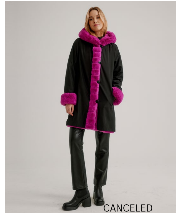
K4129R-164 COLOR: 267 BLACK/FUCHSIA