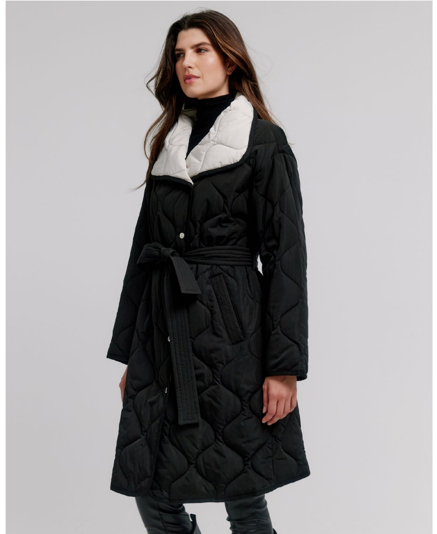
K5566R-332 COLOR: 009 BLACK