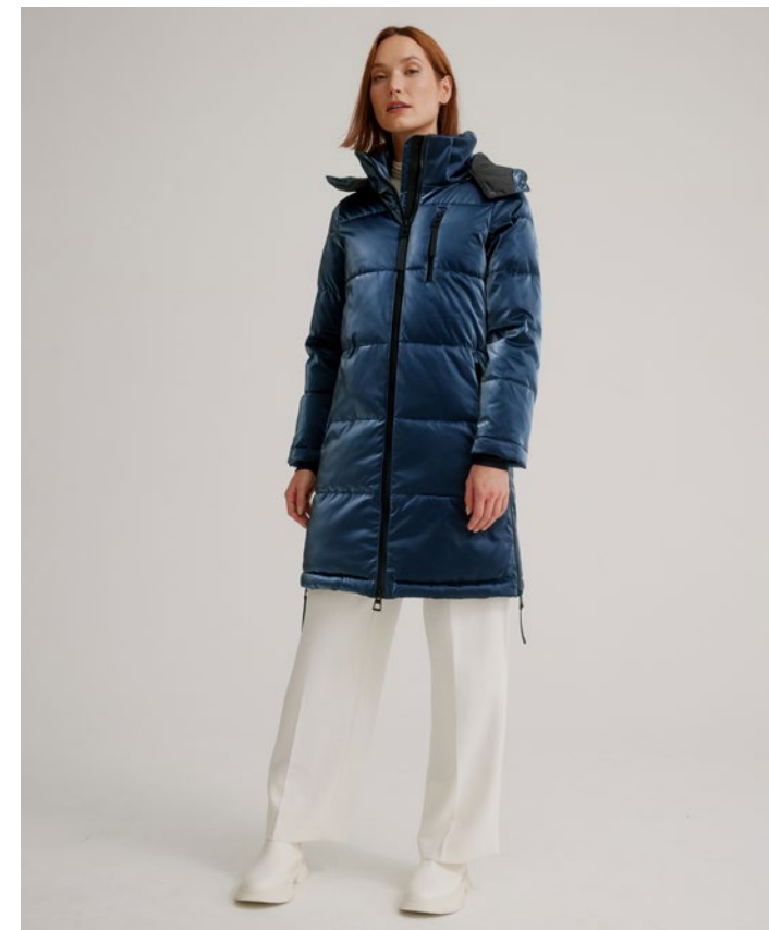
K5287R-408 COLOR: 123 PAGEANT BLUE