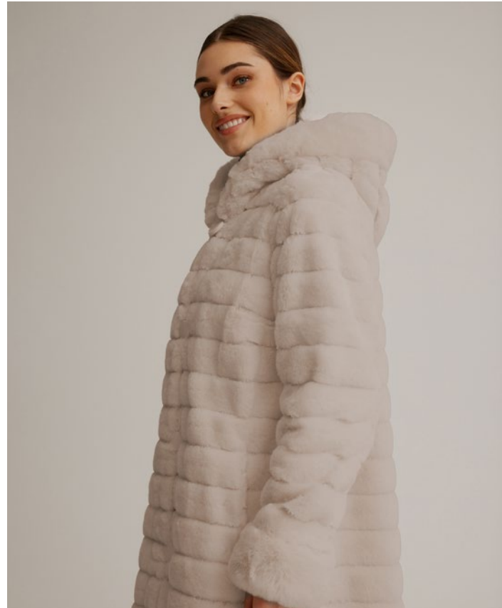
K4129R-164 COLOR: 093 ECRU (REVERSE SIDE)