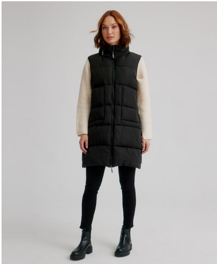
K5142R-332 COLOR: 009 BLACK