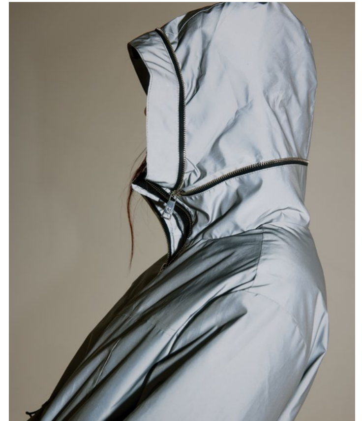
K5580R-290 COLOR: 002 SILVER (REFLECTIVE)