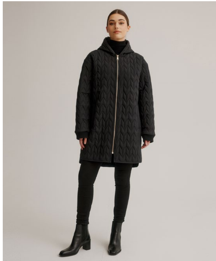
K5304RO-333 COLOR: 224 OYSTER BAY