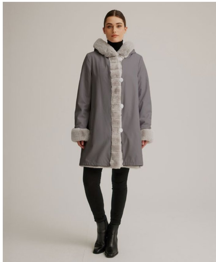
K4129R-164 COLOR: 563 CHARCOAL/SILVER