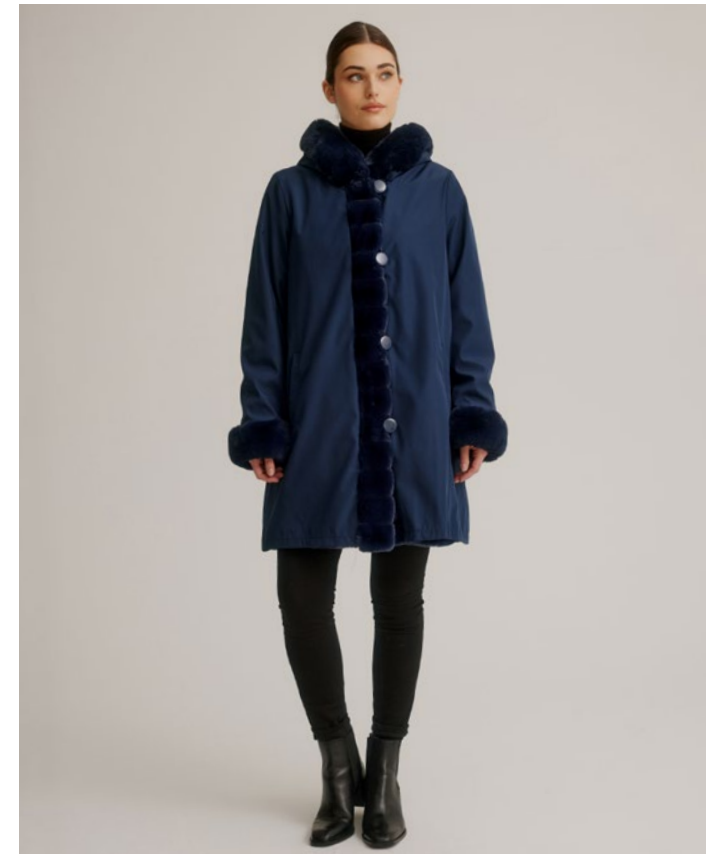
K4129R-164 COLOR: 092 DARK NAVY