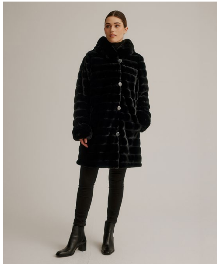
K4129R-335 COLOR: 009 BLACK (REVERSE SIDE)