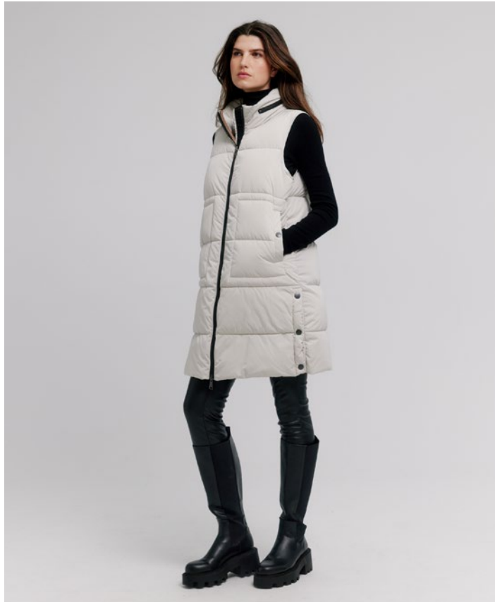
K5142R-332 COLOR: 039 SAND