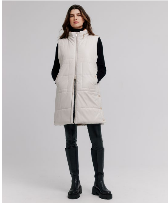
K5142R-815 COLOR: 168 CREAM