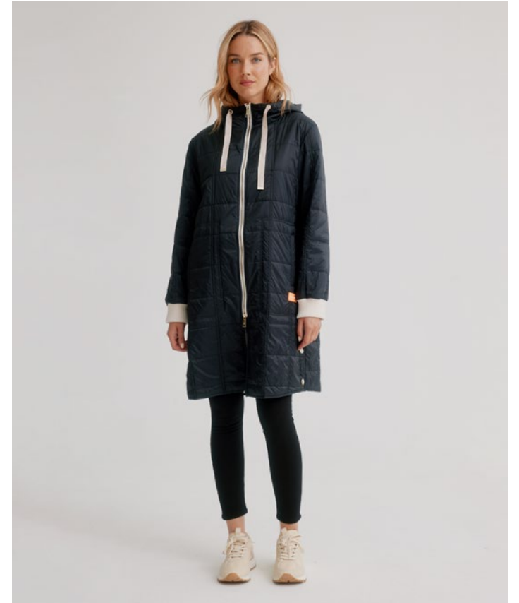
K5457R-373 COLOR: 009 BLACK