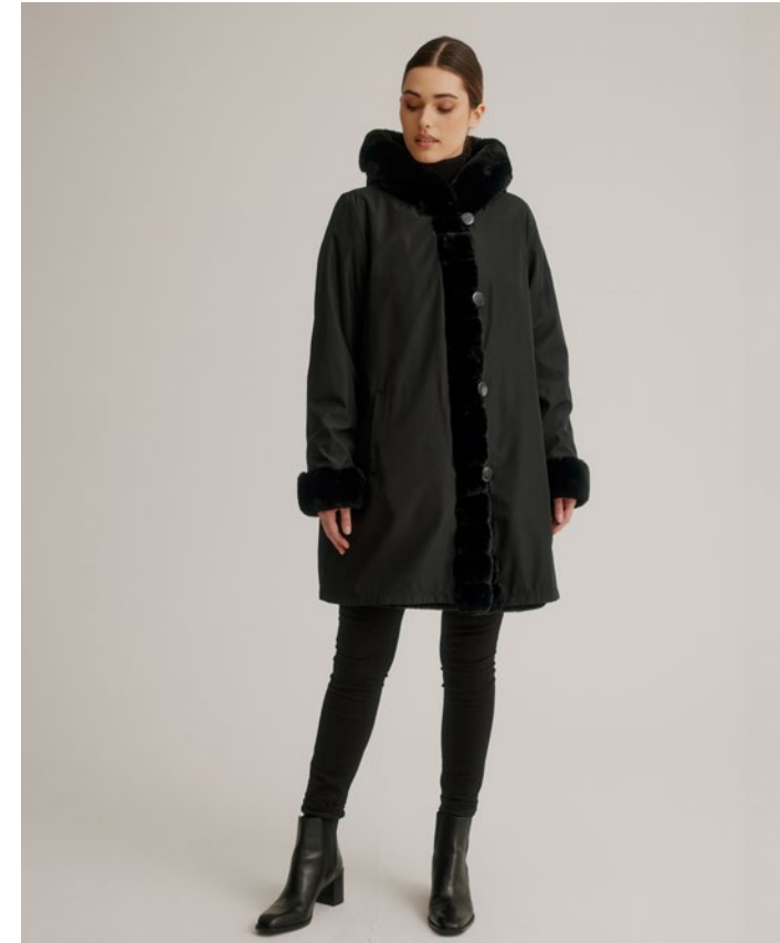
K4129R-164 COLOR: 009 BLACK