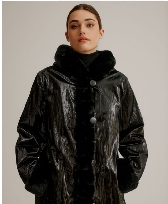
K4129R-335 COLOR: 009 BLACK