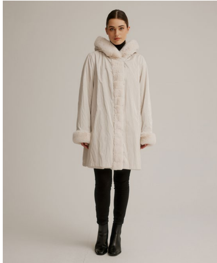
K4129R-335 COLOR: 168 CREAM