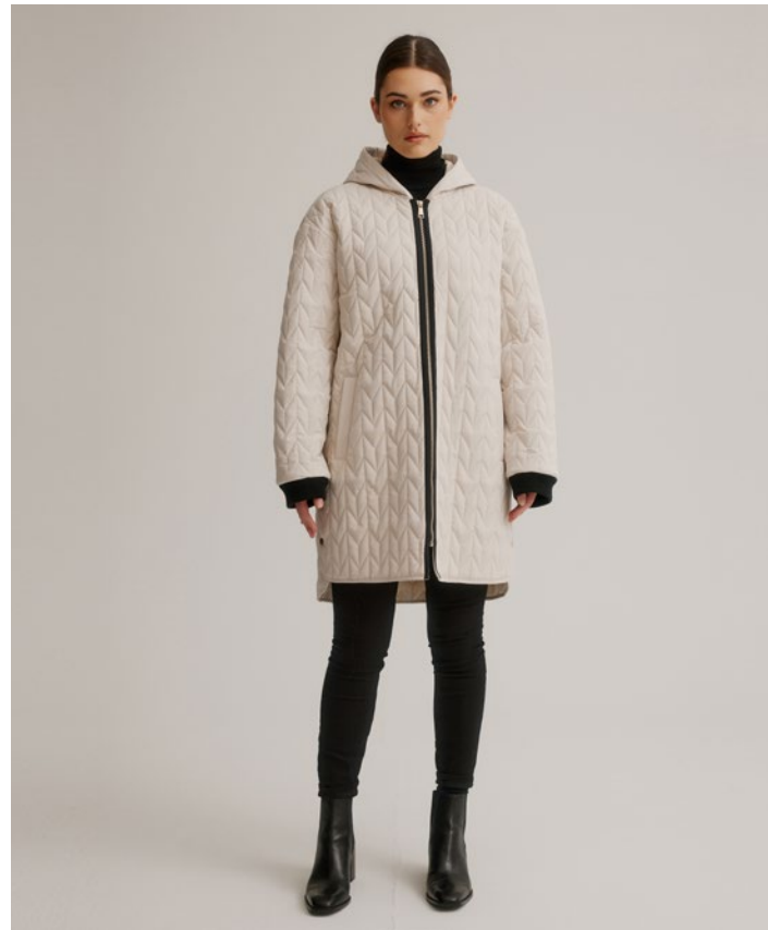
K5304RO-333 COLOR: 009 BLACK