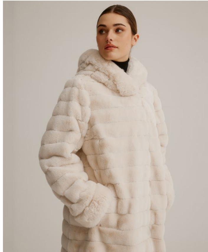
K4129R-335 COLOR: 168 CREAM (REVERSE SIDE)