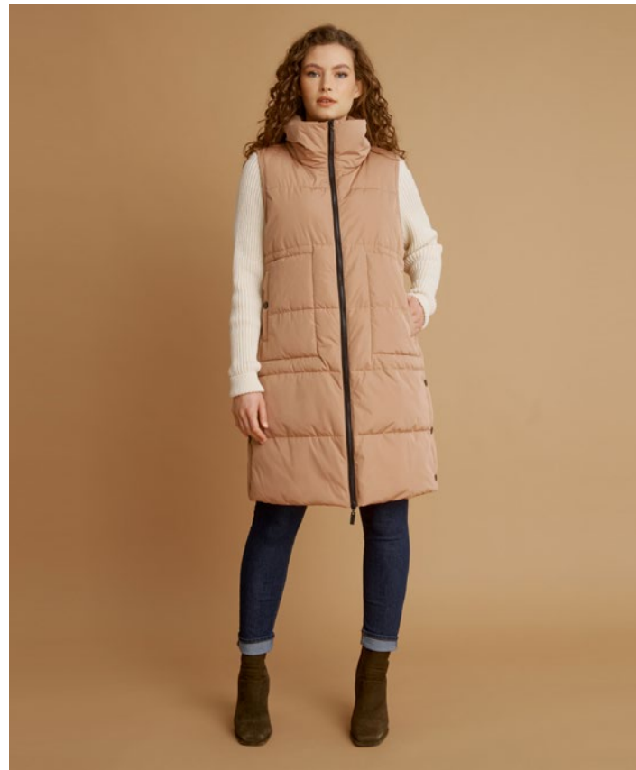
K5142R-332 COLOR: 682 BRONZED