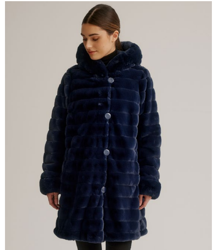
K4129R-164 COLOR: 092 DARK NAVY (REVERSE SIDE)