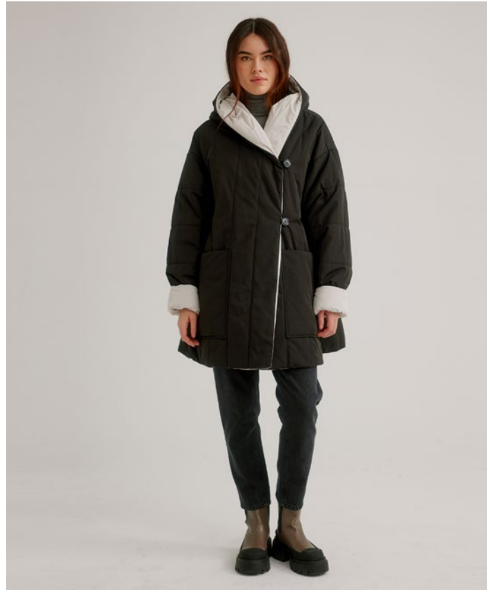
K5581R-332 COLOR: 784 BLACK/SAND