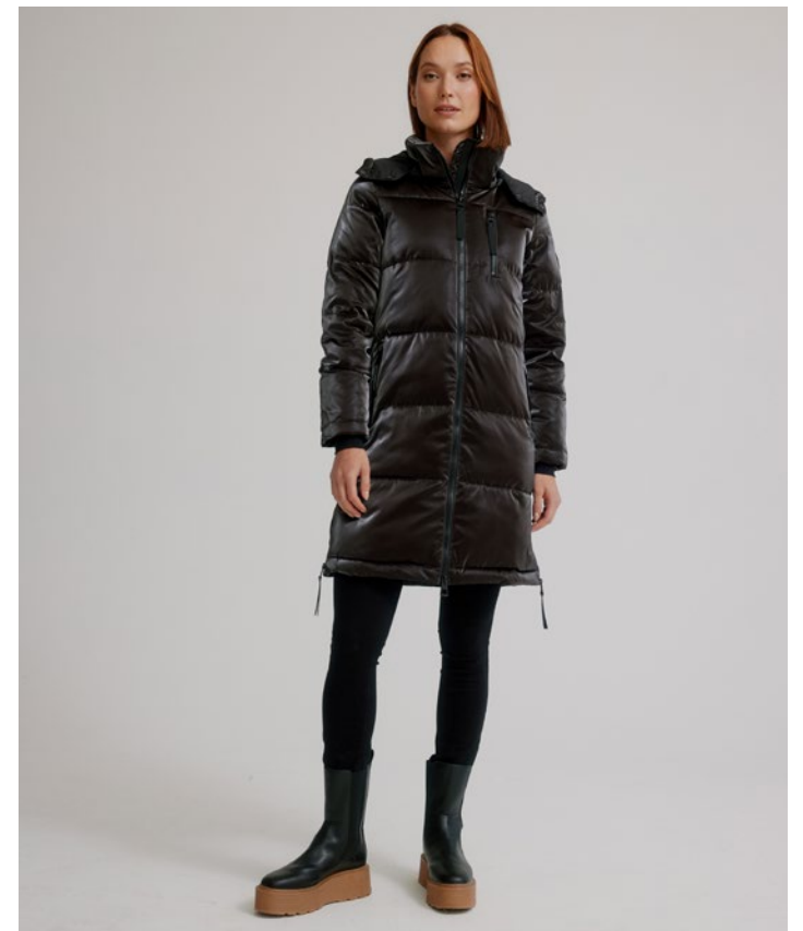
K5287R-408 COLOR: 279 COFFEE