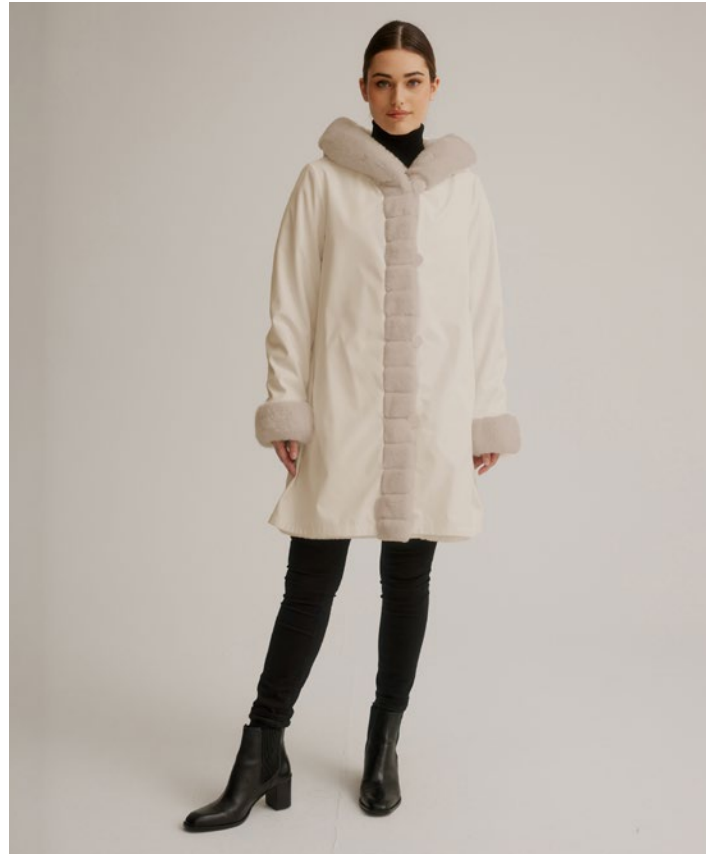
K4129R-164 COLOR: 093 ECRU