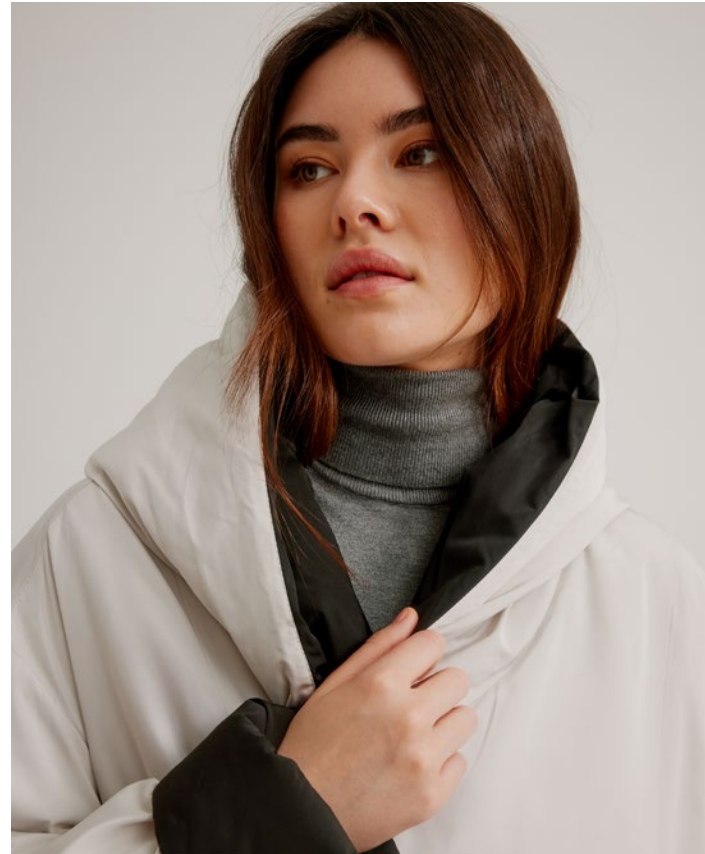
K5581R-332 COLOR: 784 BLACK/SAND (REVERSE SIDE)