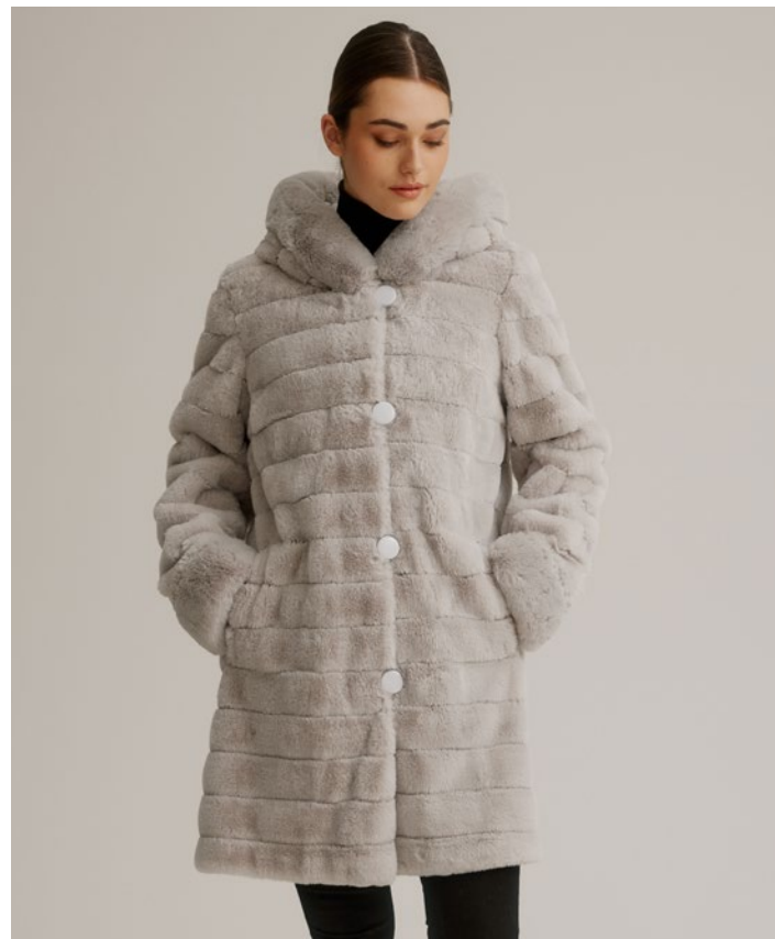
K4129R-164 COLOR: 563 CHARCOAL/SILVER (REVERSE SIDE)