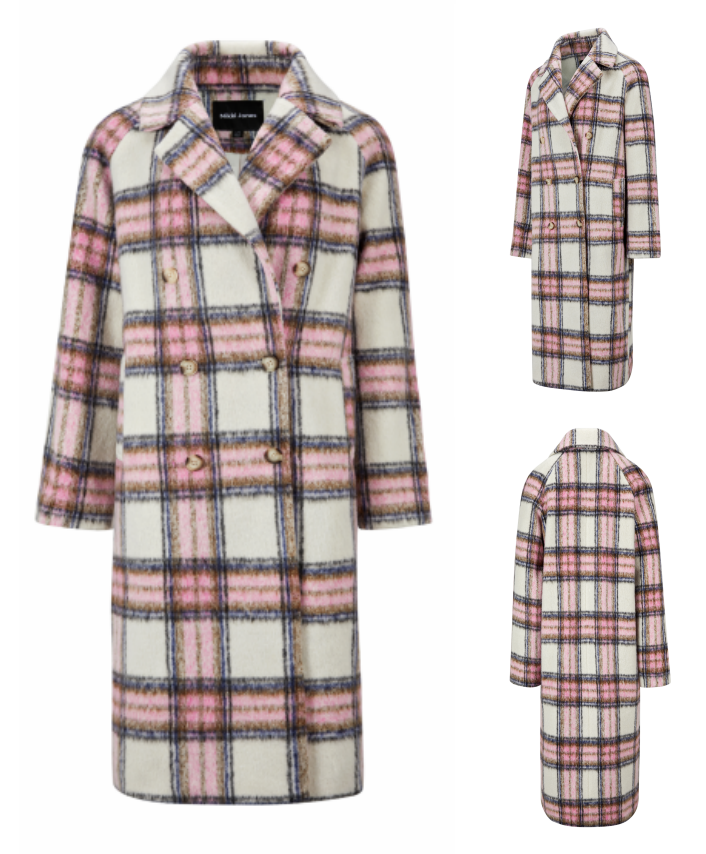
K5780R-499 COLOR: 125 PINK PLAID