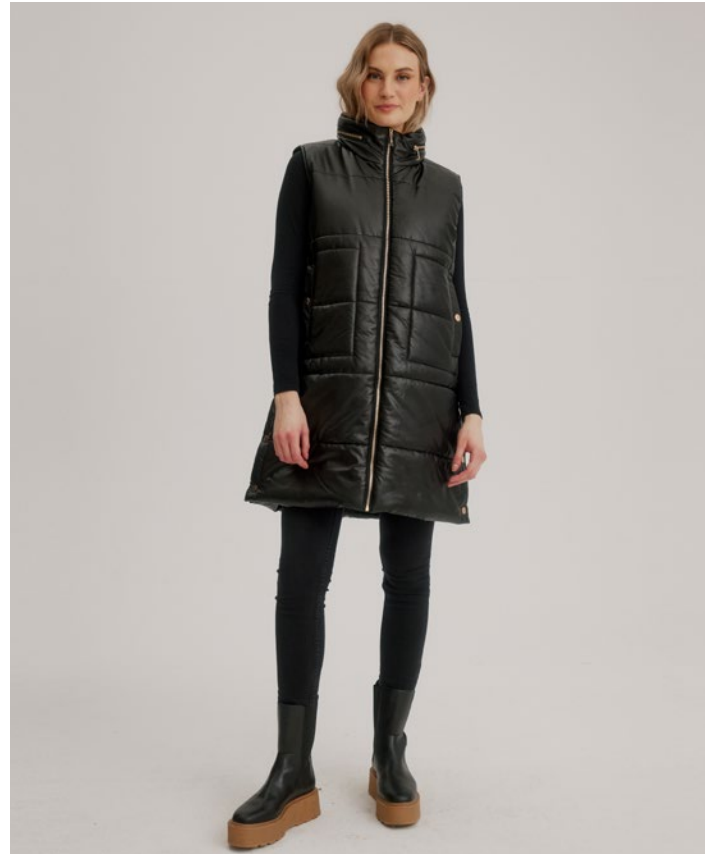
K5142R-815 COLOR: 009 BLACK