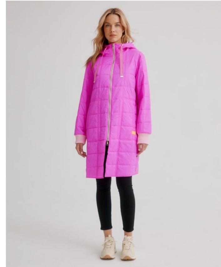
K5457R-373 COLOR: 640 PASSION PINK